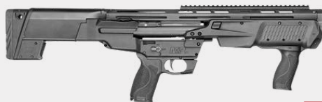
SMITH & WESSON M&P12, 12GA, 19", BLK