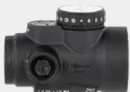
TRIJICON MRO HD, 69 MOA CIRCLE 2 MOA DOT