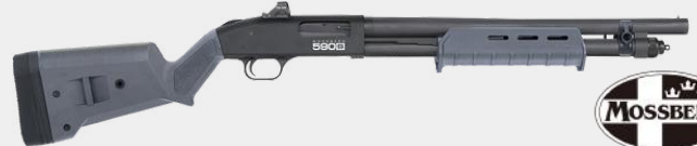
MOSSBERG 590S W/ HS407K, 12GA, 18.5, GRY