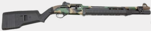
LANGDON TACTICAL LTT 1301, 12 GA, 18.5", M81