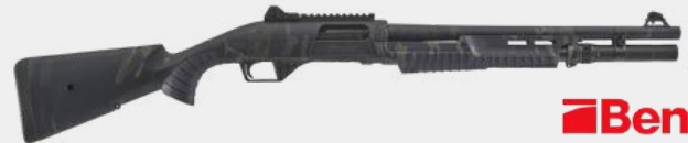
BENELLI NOVA 3 TACTICAL, 12 GA, 18.5", BLK