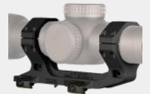
REPTILIA AUS MOUNT, 1.7", 34MM, BLK