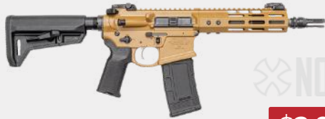
NOVESKE N4 DIPLOMAT, .300BLK, 8"