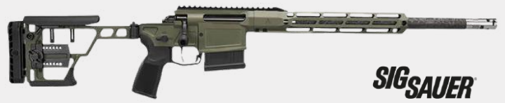
SIG SAUER CROSS SAWTOOTH, 6.5 CREEDMOOR