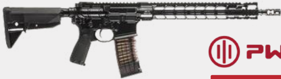
PWS MK114 MOD 2-M, 5.56MM, 14.5